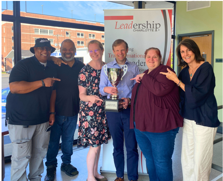
Best Class Ever Award LC43